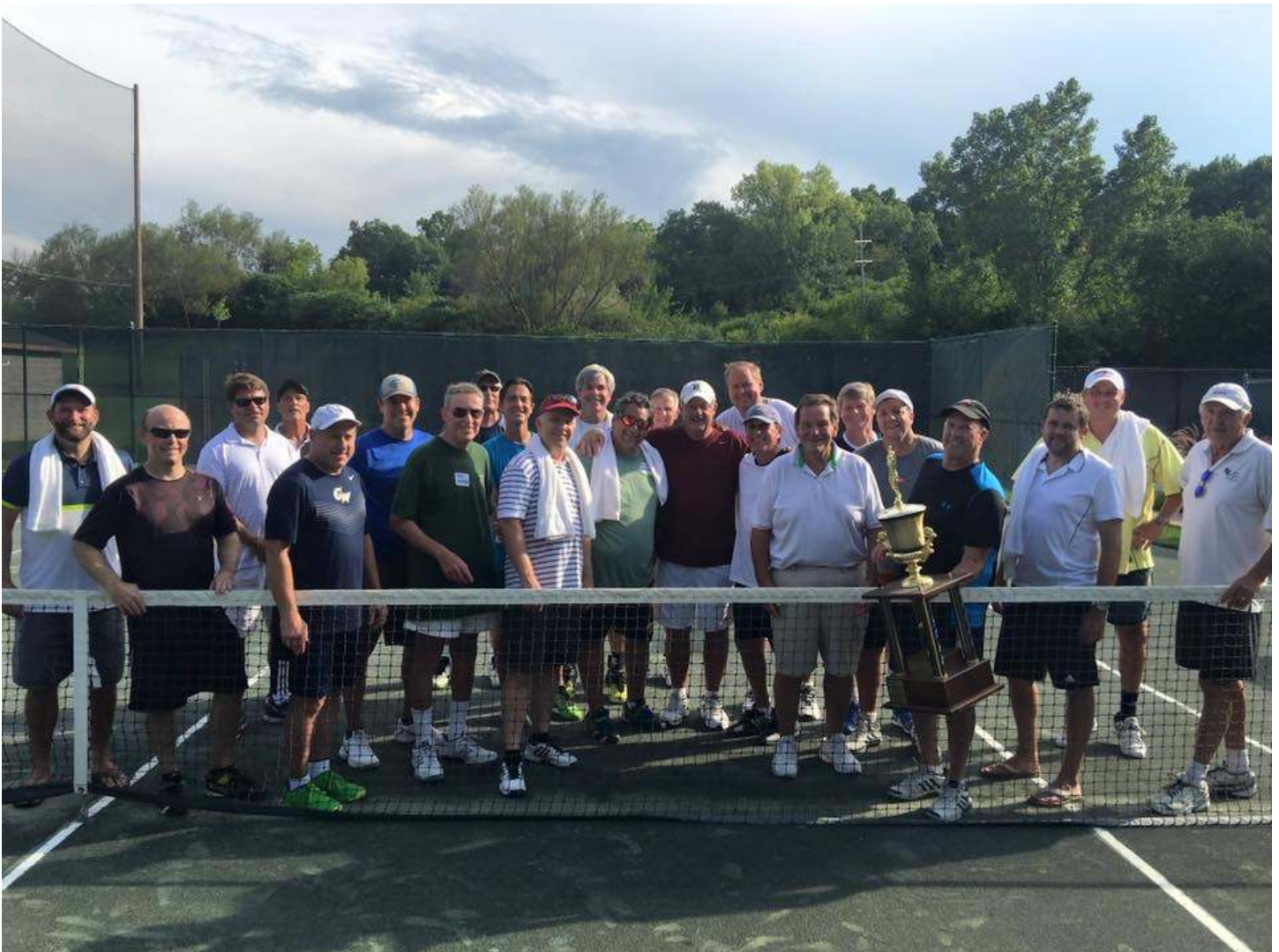
Fox Point Men's team wins the illustrious Travelling Trophy at the Fox Point v. Biltmore Tennis Open

Fox Point Women's Cooking Class, Deer Park Williams-Sonoma